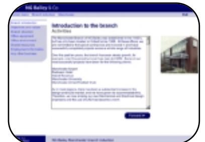
Multi-site induction with content editing tools