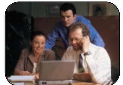
Ask for a demonstration and a free project proposal