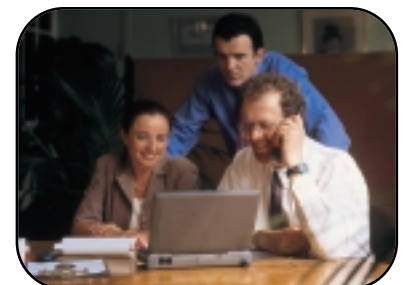
Ask for a demonstration and product costing