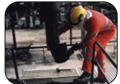
Video production for your title covering; safety, operations, procedures etc.